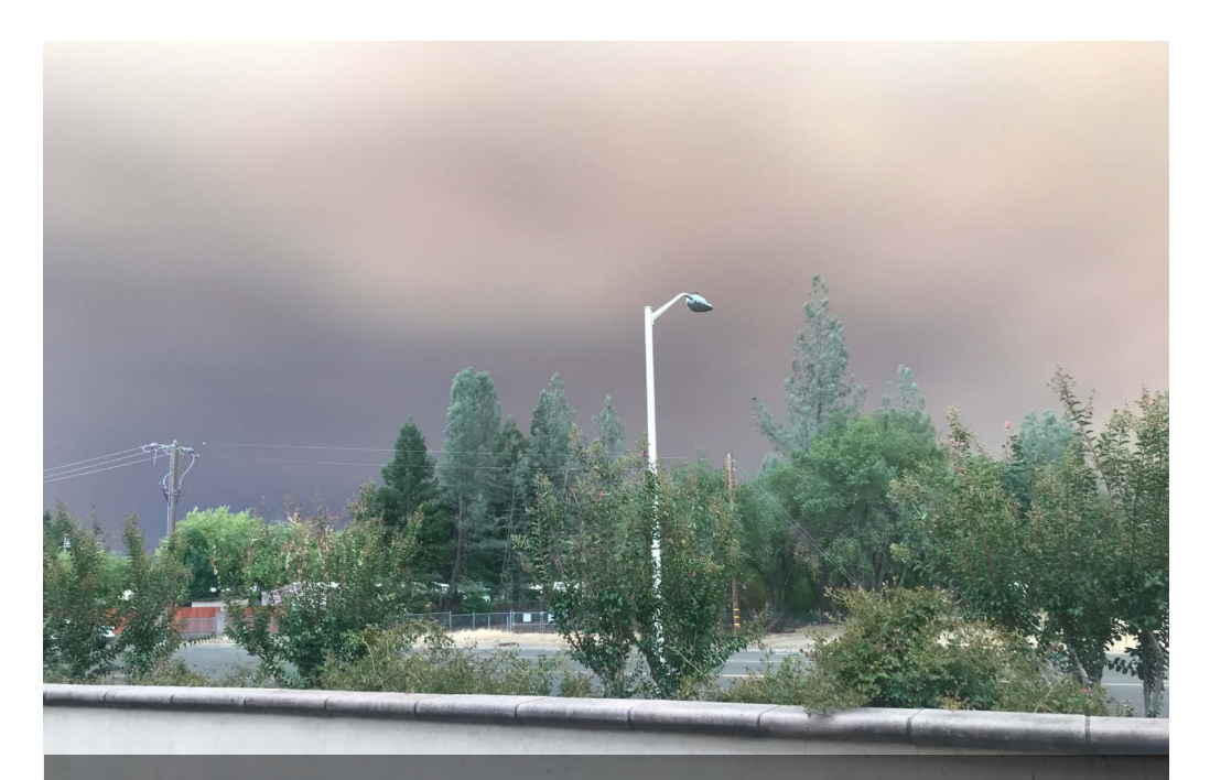
Does it make sense to talk about the effects of climate change or of systemic corruption as threats to national security?

It is tempting for reformers to adopt the language of national security in pursuit of policies that would help protect the interests of popular constituencies. But we should be wary that we don't operate in a register that is far more congenial to our opponents. Grace Blakeley draws the outlines of the trap, and suggests how we might best avoid it.