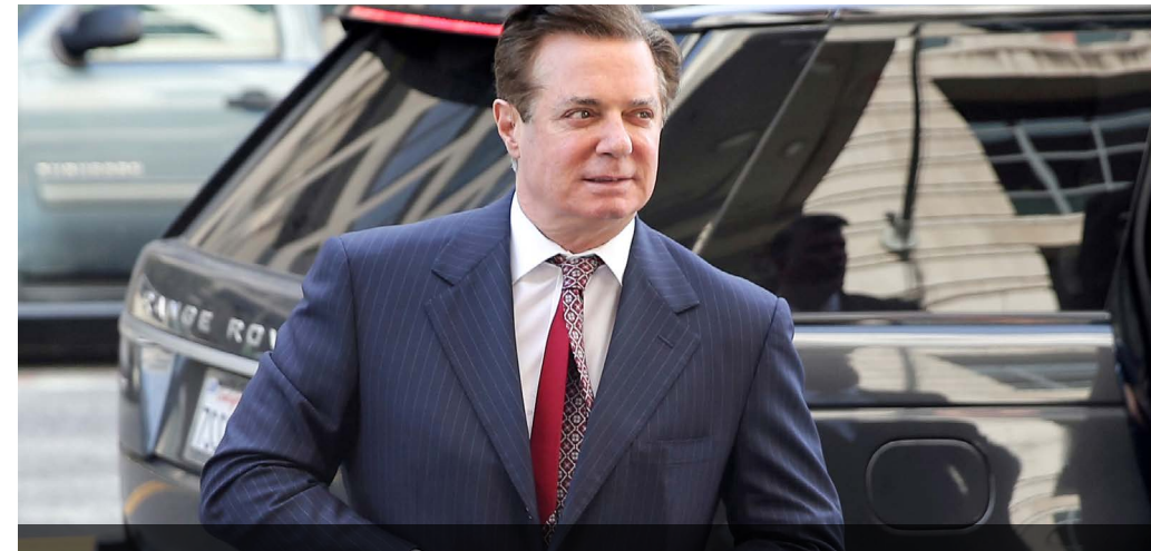
After successfully chairing Donald Trump's 2016 election campaign Paul Manafort went on to be successfully convicted for tax evasion and money laundering two years later.

ational security practitioners have become increasingly aware of the threat of 'Kleptocratic regimes' and 'strategic corruption' to the internal politics of liberal-democratic polities. In the classical version of this narrative, authoritarian regimes exploit global financial and business networks to penetrate the internal politics of democratic societies and secure their domestic rule by exploiting the self-interest of particular business groups.<sup>1</sup> Some have even suggested that foreign 'dark money' might enter the democratic process by supporting particular candidates.<sup>2</sup> The common thread that unites these views is that dark money is seen as a foreign policy problem and thus related to either extrasystemic actors or foreign competitors that exploit legitimate systems.