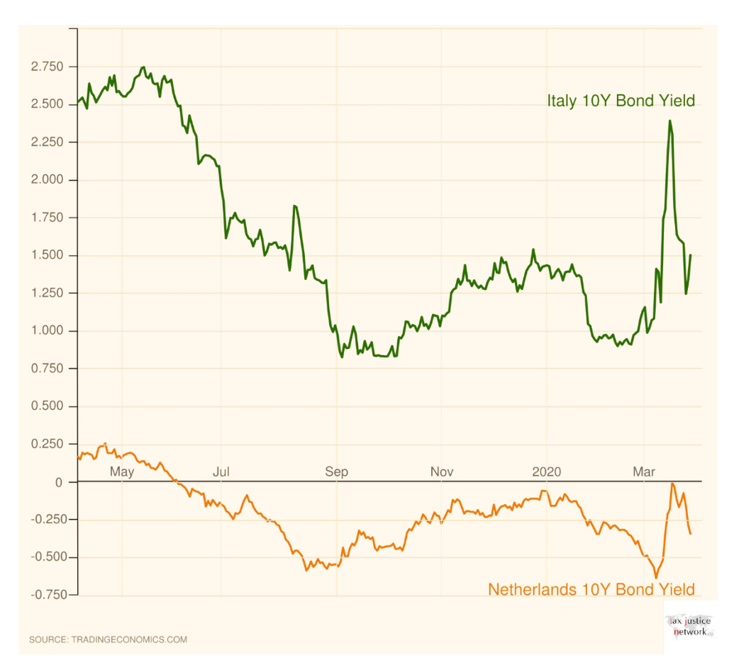
Figure 1. 10-year government bond yields over time

Joint issuance would therefore be a deliberate act of solidarity: an overall saving for governments, but with some additional costs borne by the richest (those facing lower current costs of debt). Historically, governments in the richest economies (typically in the west and north of the eurozone) have resisted such initiatives – arguing that the poorer economies of the south and east should be 'more responsible', enacting 'austerity' measures in order to lower their (individual) borrowing costs.