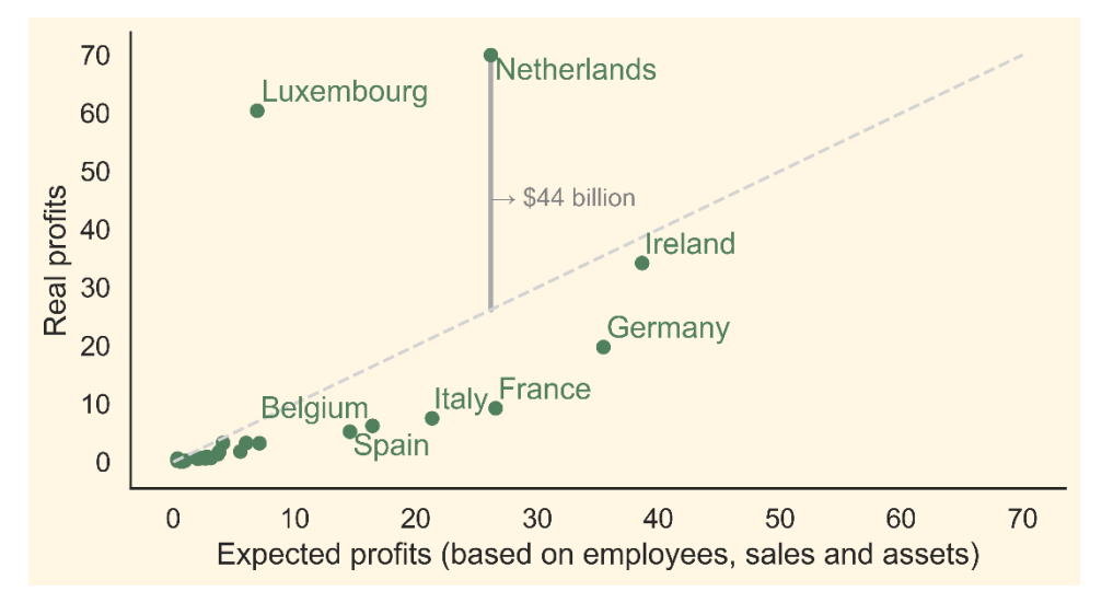
Figure 3. Expected profits (based on reported economic activity) versus profits booked in the jurisdiction. Profits are shifted to countries above the diagonal line

By continuing to tolerate this behaviour, the EU is accepting that other members lose in the region of $10 billion to $15 billion each year ($10.4 billion in 2017), in order for the Netherlands to take a cut of just a couple of billion dollars. On top of that, the Netherlands' behaviour has undoubtedly accelerated the race to the bottom in European corporate tax rates, which have fallen by around ten percentage points over the last decade – bringing further revenue losses across the region.