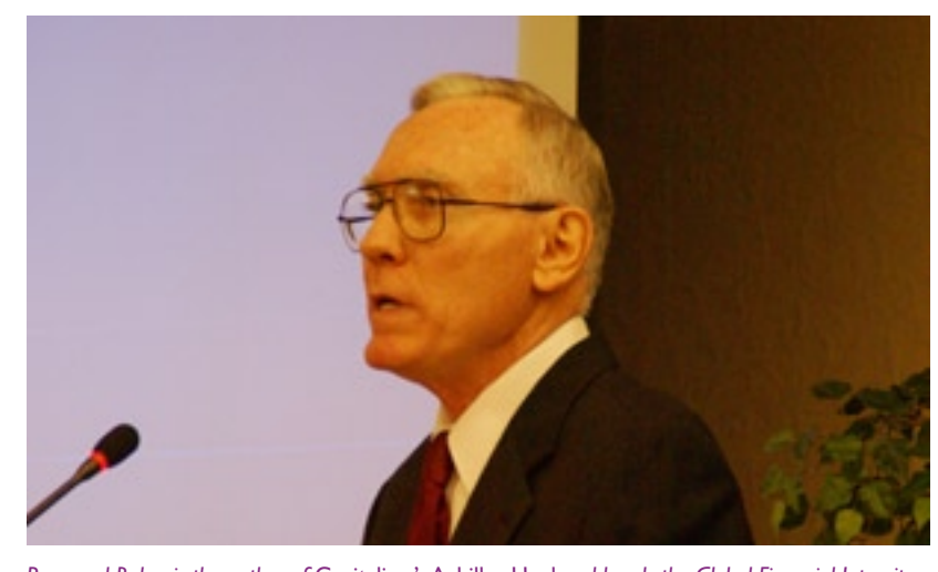
Raymond Baker is the author of Capitalism's Achilles Heel and heads the Global Financial Integrity program in Washington. www.gfip.org

"A mineral exporting nation serving as an offshore financial center and tax haven is surely the worst combination possible. Ghana's own wealth will inevitably get sucked into this black hole, driving apart rich and poor and forestalling economic development. Opting for such an unwise step should signal the end of any further need for foreign aid."