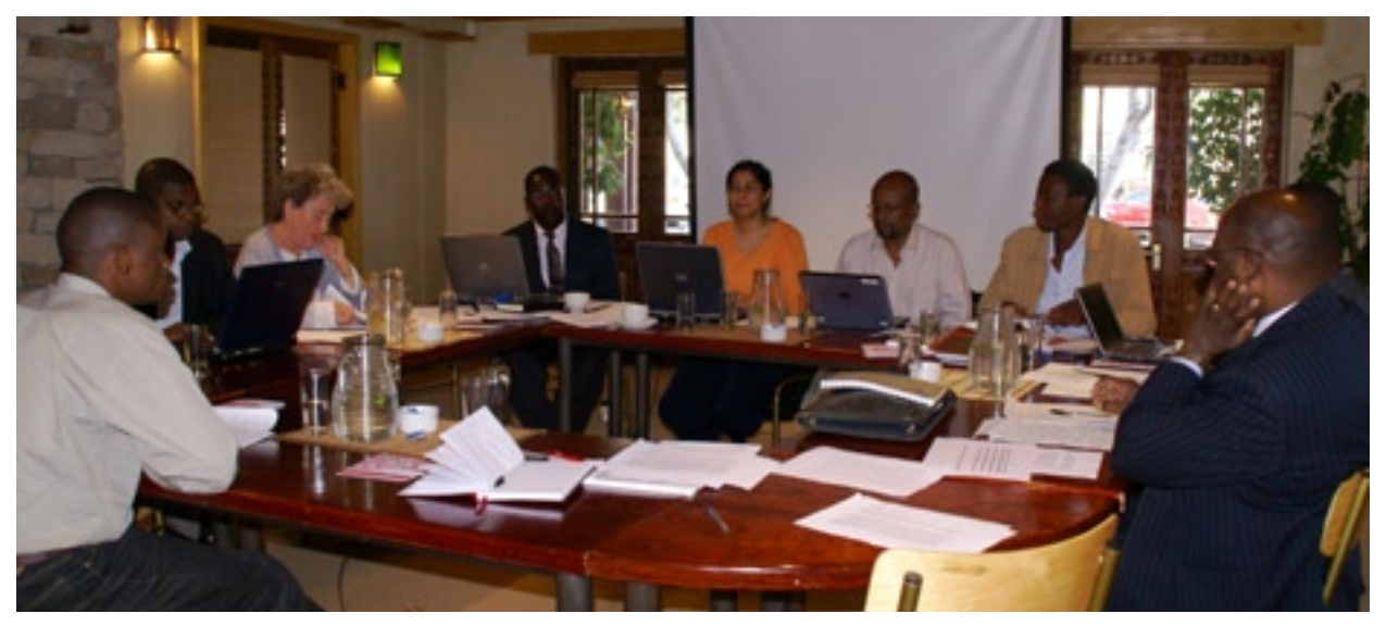
Representatives from eight African countries meeting in Cape Town, June 2007

SIX MONTHS AFTER THE launch of the Tax Justice Network for Africa, its Steering Committee met for the first time at the end of June in Cape Town, to map out its network development, research, campaign and advocacy priorities for the coming 24 months.