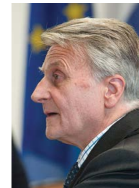
Jean-Claude Trichet, admirer of the Irish model. Here seen facing right.

Republican candidate for the presidency in the U.S. The first priority is to deregulate and reduce worker's rights.