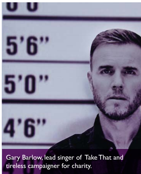
Gary Barlow, lead singer of Take That and tireless campaigner for charity.