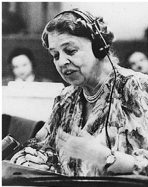
Eleanor Roosevelt, one of the architects of the Universal Declaration of Human Rights, photographed at the United Nations in 1947.

stressing that without the necessary funds to alleviate poverty, “realising human rights is rendered meaningless.” Whether revenue is lost through illicit financial flows or austerity measures, she argues that states that do not take steps to collect all taxes owed are not meeting their obligations to realise economic, social and cultural rights.