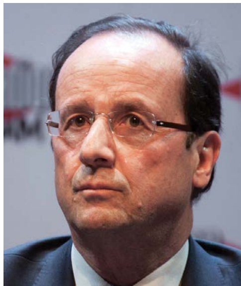
The irresistible François Hollande, back in the pages of the Tax Justice Focus.

According to Reuters the French government is planning to reduce the interest payments on late payments of tax by companies.