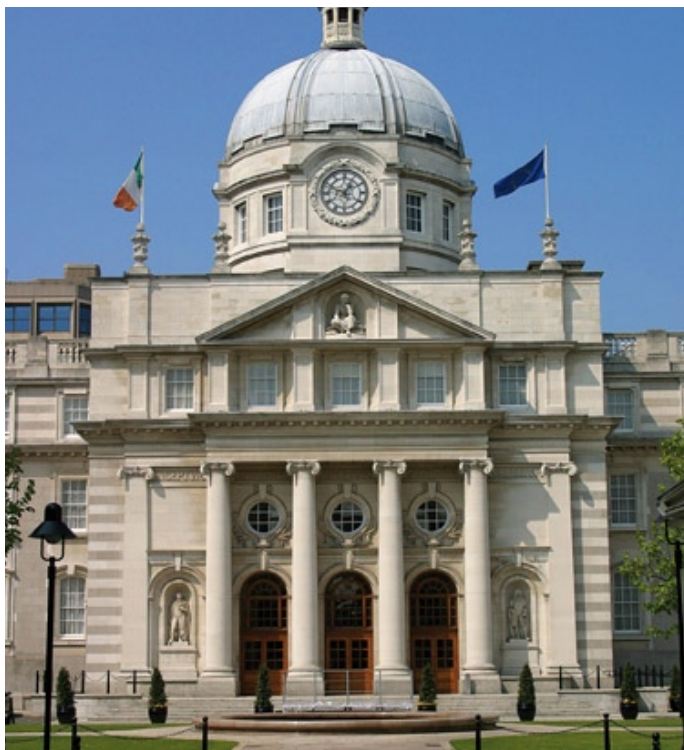
Department of the Taoiseach, Dublin, Ireland

Ireland offers two main incentives. One is a 20 per cent tax credit for any increase in R&D spending after 2003. Given that the tax rate in Ireland is currently only 12.5 per cent, this effectively allows a 160 per cent tax deduction for qualifying expenditure, which covers a wide range of activities. Naturally, this encourages multinationals with an Irish presence to designate as much as possible of their spending there as R&D. A second 'anchoring' strategy is a total exemption from tax for patent income, where the associated R&D work has taken place in Ireland (see box). So as multinationals increase R&D spending in Ireland, they can patent the resulting technology and charge patent royalties to other divisions of the group. The stream of royalties is not taxed when dividends are received in Ireland, and no withholding