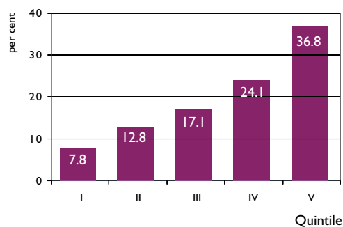
Figure 1: VAT Implicit Subsidy by household income (quintile I = poorest)