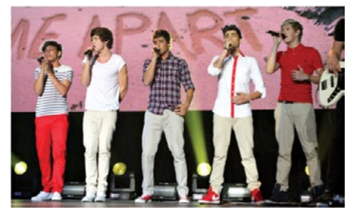
Another, entirely justified, picture of famous people.

On the one hand, global pop sensation One Direction are calling on their millions of fans to put pressure on the UK government to keep its commitment to