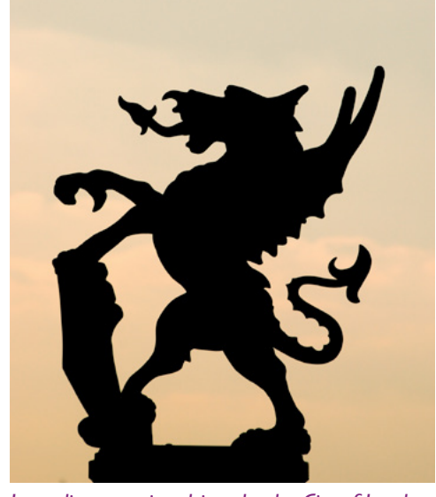
Is credit expansion driven by the City of London a drag on growth?

Second, the broader process of privatisation and the extension of public-private partnerships disproportionately benefit a global city like London. London does attract capital, but it does so because it is a kind of conversion machine, taking national and international assets, converting them into revenue streams from which well-placed individuals skim high pay. In other words: London attracts capital because it is also extractive. Let's take the UK's Private Finance Initiative (PFI)<sup>4</sup> as an example. The PFI is a form of Public