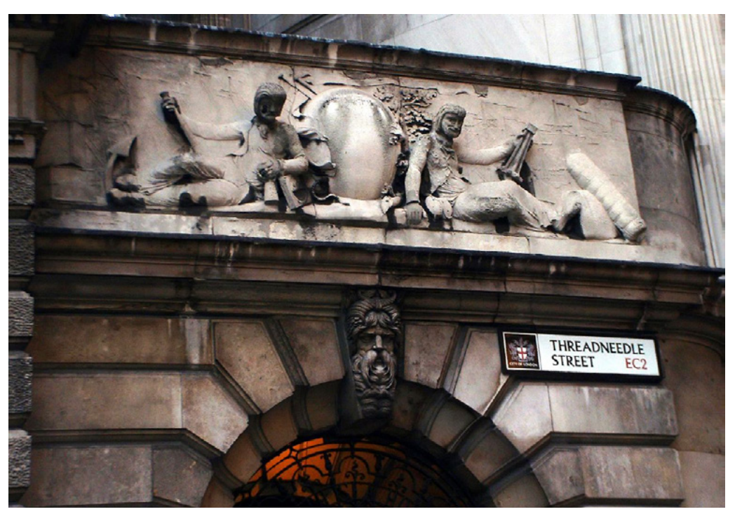
Crowding out productive enterprise in the City of London. Threadneedle Street, once teeming with small businesses specialising in the garment trade, now home to a very different kind of stitch-up.

much more difficult for other sectors); the pervasiveness of individualism and competitive greed. But the way these things work out on the ground in different places highlights even more the contradictions inherent in this social settlement.<sup>2</sup>