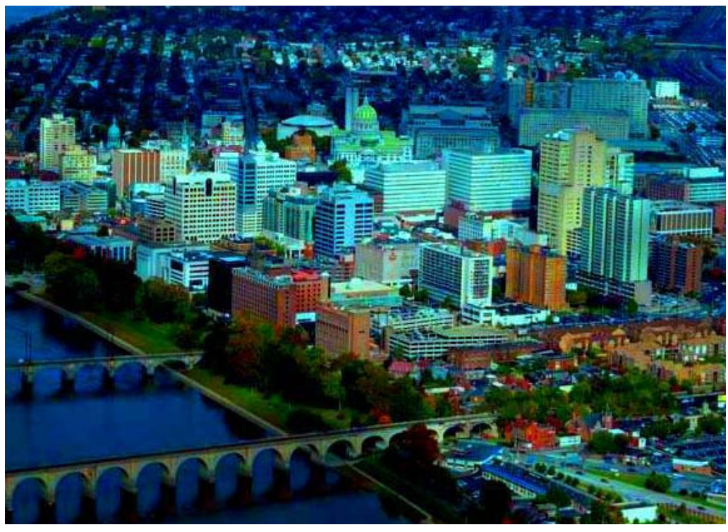
Harrisburg, PA – LVT has contributed to sustained economic resurgence

By the end of 2007, the number of businesses on the City's tax rolls had risen to 5,278 --