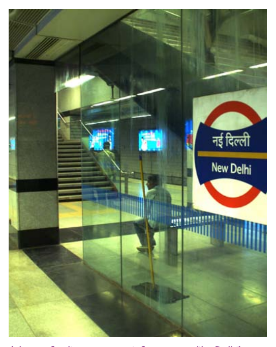
A key to funding transport infrastructure like Delhi's new underground?

Second, land value taxation provides revenue for governments, permitting them to reduce taxes that have harmful effects on economic development. Taxes on wages discourage people from working. Taxes on saving or investments discourage people from saving and investing. Sales taxes and value added taxes