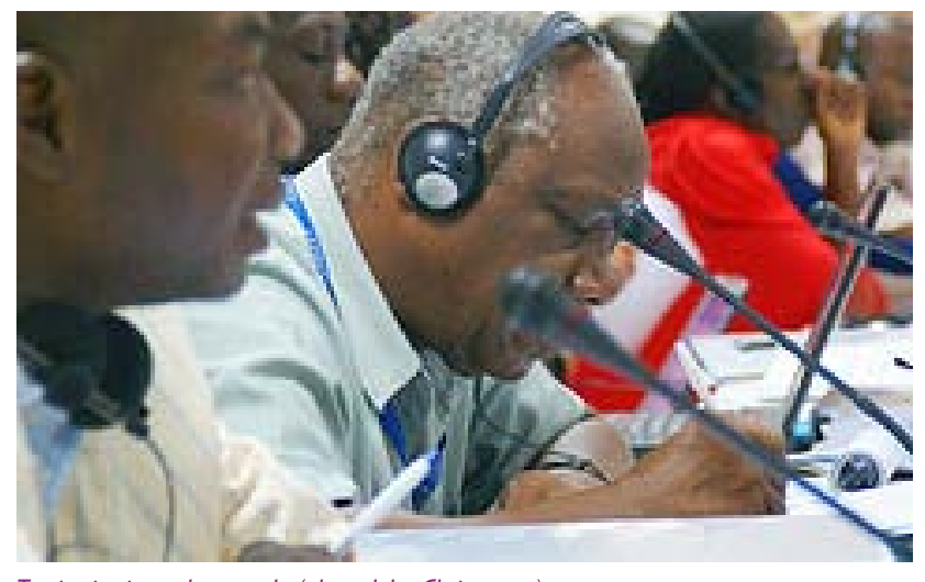
Tax justice is on the agenda

Since its launch in 2007 TJN for Africa has given priority to mobilising African civil society around the issues of tax and domestic resource mobilisation. In March 2010 delegates from 17 countries and 3 continents met in Nairobi, Kenya for a Pan-African Conference on Tax and Development. The conference had three key themes: harnessing domestic tax policies for development; taxation of extractive sectors; and closing the floodgates on illicit financial flows.