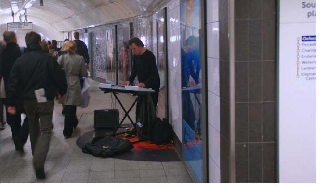
Perfect pitch: busker at Oxford Circus, Central London

"Buskers instinctively understand the phenomenon of economic rent"