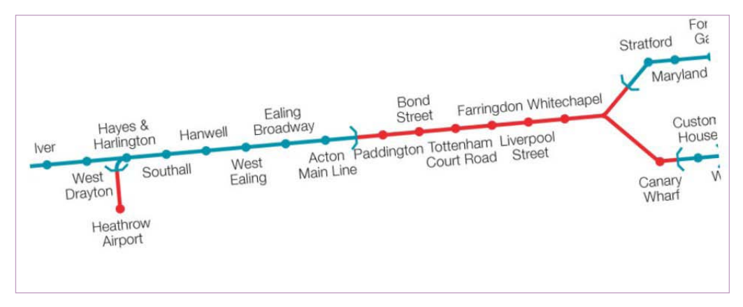
The £16 billion Crossrail project in London will provide massive windfall gains to the City, through higher property prices. With an LVT, the beneficiaries would pay for it, letting other British taxpayers off the hook. British land is distributed more unequally than in Brazil, where I per cent of the population owns 49 per cent of the land. In the UK, 0.3 per cent owns 69 per cent.

Well known criteria for a good tax system include fairness, affordability, minimal cost and ease of collection, certainty, transparency, and flexibility.